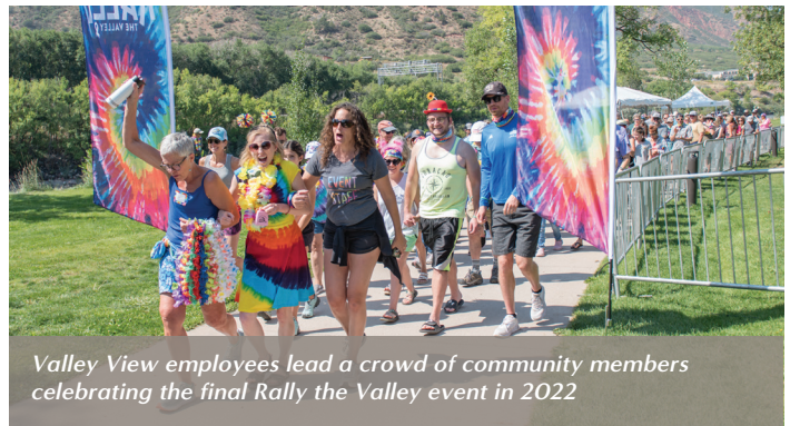
Valley View employees lead a crowd of community members celebrating the final Rally the Valley event in 2022