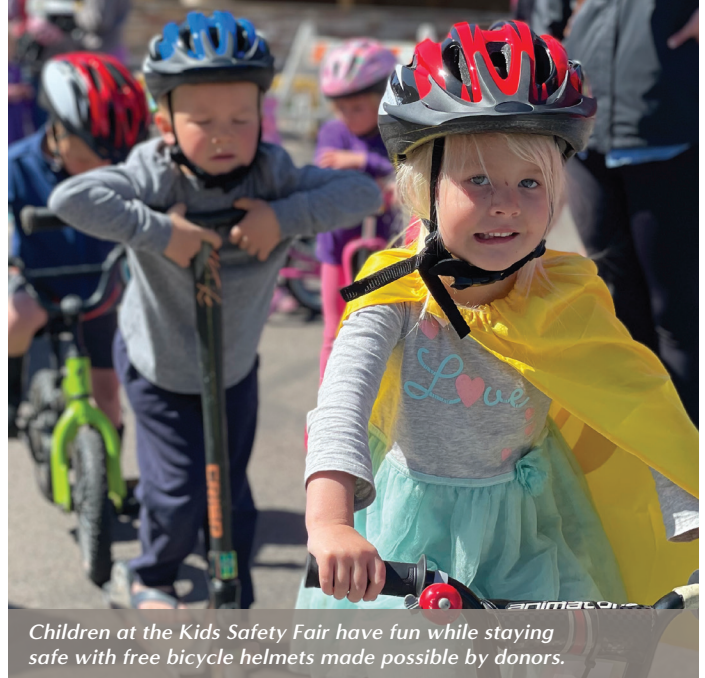
Children at the Kids Safety Fair have fun while staying safe with free bicycle helmets made possible by donors.

Funds raised from donor support also enable care providers to supply pregnant patients receiving treatment at Women's Health with resources to test for Gestational Diabetes, completely free of charge for those unable to afford them. This project eliminates the financial obstacle for pregnant patients at risk for Gestational Diabetes, helping to prevent adverse outcomes for the patient and their baby.