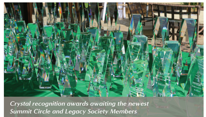
Crystal recognition awards awaiting the newest Summit Circle and Legacy Society Members