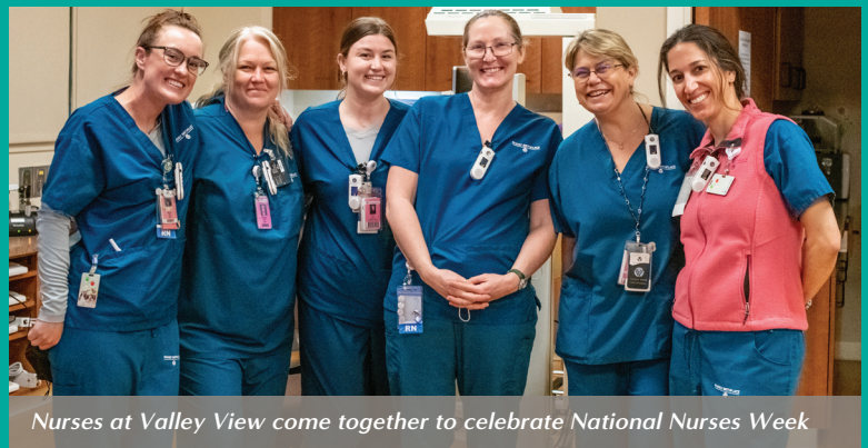
Nurses at Valley View come together to celebrate National Nurses Week