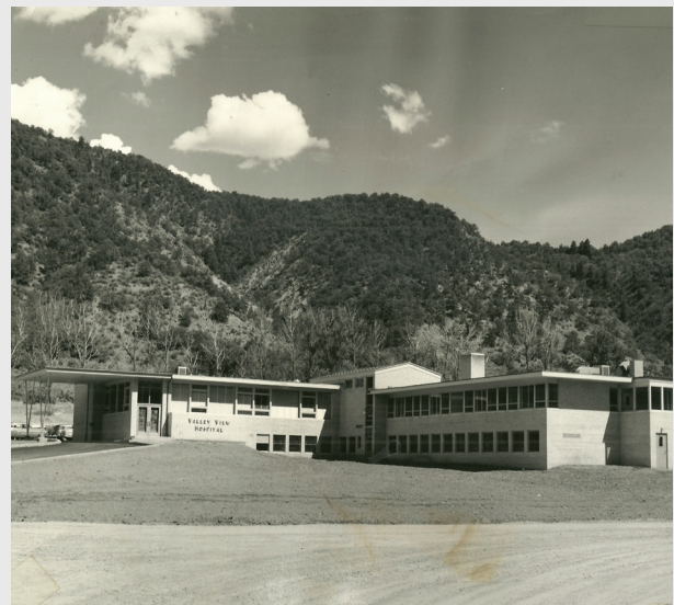
The original Valley View Hospital building